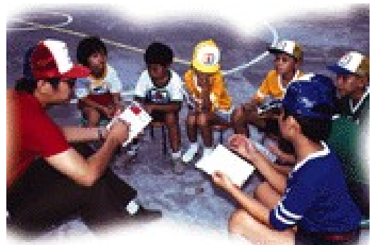
Their uniforms are shirts, with patch awards.

Thanks for your international witness, Awana T&T Directors Camarillo Community Church